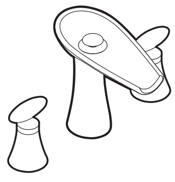
VIVID Two Handle Widespread Lavatory Faucet Trim